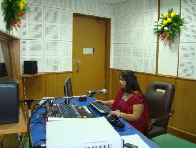
Fig. 2 Studio for Community Radio