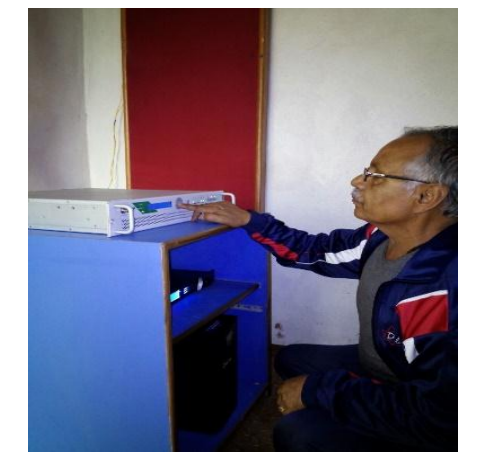
GSJ© 2018 www.globalscientificjournal.com

UPS of 1500 VA were used to provide power to this area and to take care of irregular power supply.