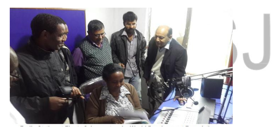
Fig. 7 Training at Finote Salem, Ethiopia

A cue sheet which is the time schedule for operating the CR was drawn and the broadcast transmission was started from each station. The typical broadcast from Cuba Daresay by local woman after training is shown in Fig. 8. The programme was directed towards educating the community in health and hygiene, farming, selling their products, woman empowerment etc. The format was traditional story- telling, folk dance, rural drama and musical variety used by the communities in their daily life. The language was local namely Amharic, Oromo, Hebrew, Arabic and Tigrinya.