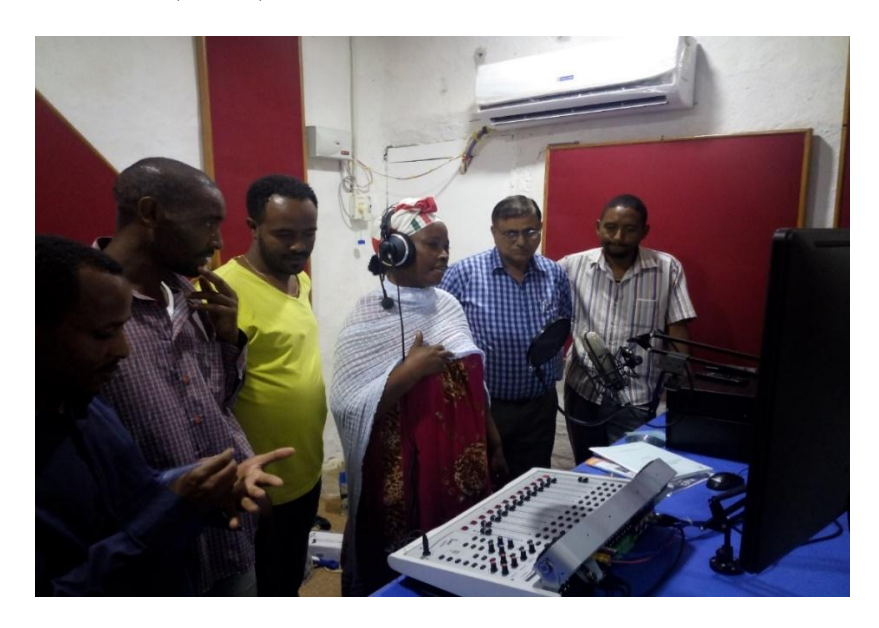
Fig. 8 Broadcast from Cuba Daresay, Ethiopia