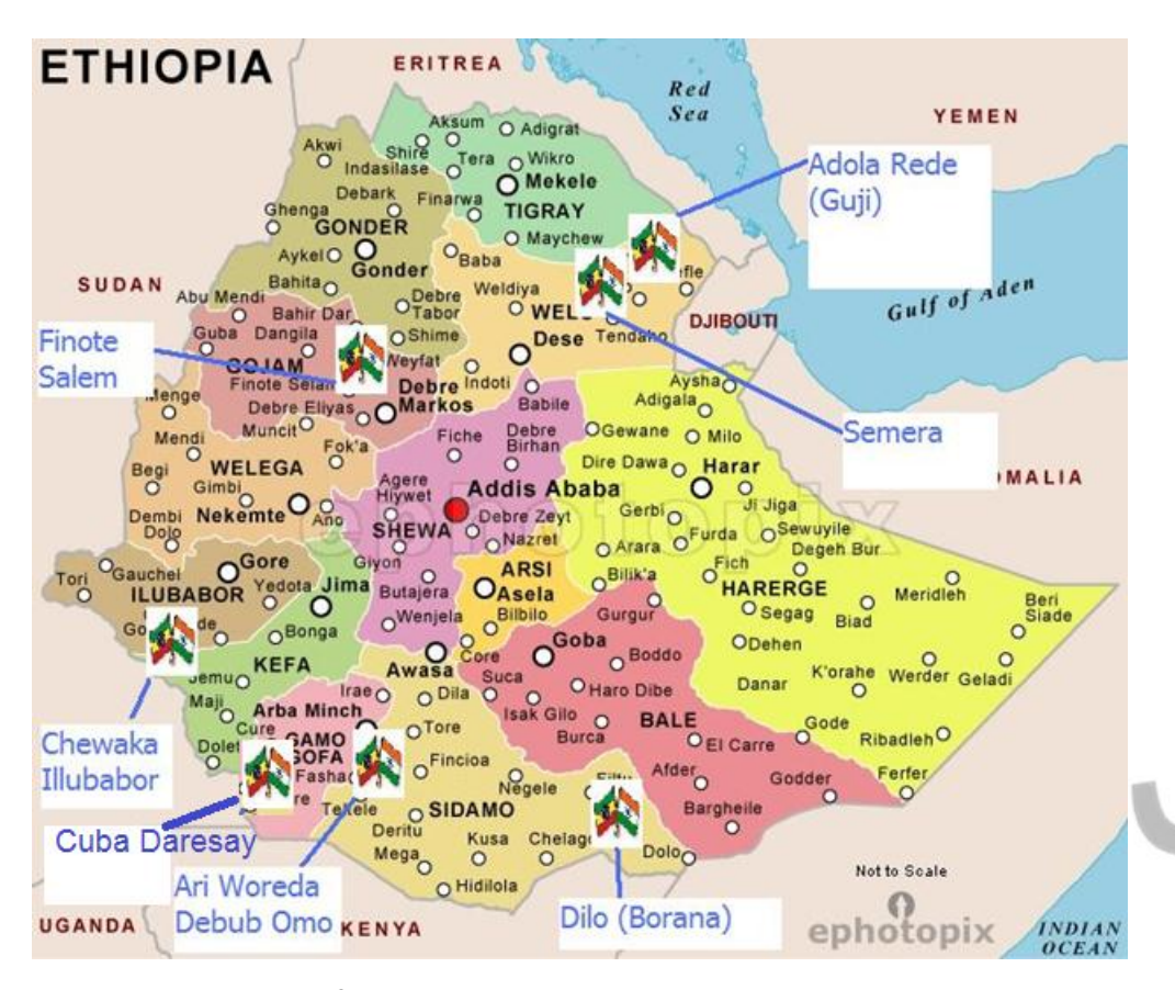
Fig.4 Locations of Community radio stations in Ethiopia

It will be seen from the Fig.4 that the locations chosen were in remote corners of the country inhabited by very poor people with low agricultural income, high poverty level, poor economic development, food insecurity, lack of facility for health and treatment, low education [31]. The CR scheme was conceived by the Government of Ethiopia to serve as an avenue for the free flow of beneficial information aimed at uplifting the plight of the various sectors of the community. The stations were aimed to open possibilities for everyone, especially regular citizens, to express themselves socially, culturally, politically and spiritually, thus preparing every member of the community to participate in decision-making. The main objective of the project was described as below.